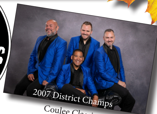
2007 District Champs Coulee Classic