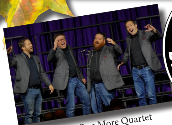
Just One More Quartet